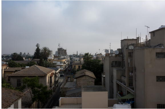
Arsinois Street, Nicosia

during summer.' Sahara dust, which I sweep out of the apartment the next morning after mopping the floor the previous night.