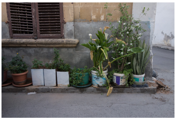
Street gardens in North Nicosia