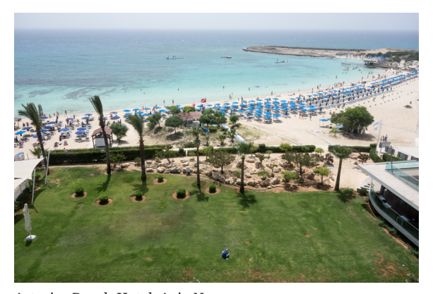
Asterias Beach Hotel, Agia Napa.

dures. In the end, they travel home with a 1,800-euro carpet and the guilt of having resisted the 2,000-euro jewellery.