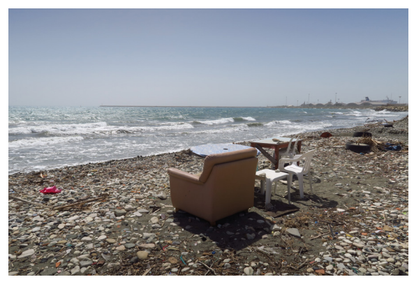
Karnayio, Limassol