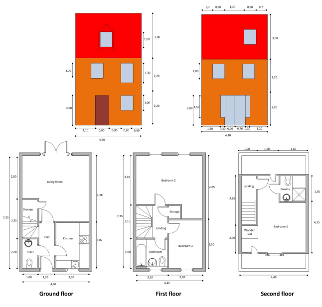
Figure 1: Floorplan of an average terraced house

The '2011 Census' key statistics show that nearly all dwellings are unshared houses (99.9%) and 30.4% of it are terraced houses [10]. A terraced house is a house which shares two of its walls with the neighbouring houses, like a rowhouse [11]. The average household size is 2.3 people and the average number of bedrooms is 2.8 [10]. This means that commonly a couple lives in a terraced house with three rooms. Based on the investigation of ten houses, built in the last ten years in Cardiff, with three bedrooms, it appears that the terraced house has mostly three levels (80%). Figure 1 demonstrates the interior layout of a typical terraced house and in Table 1 the dimensions, size and floorarea are presented.