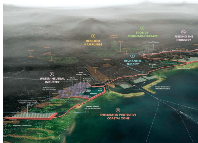
figure 3 Conceptual design of the climate resilience proposals developed in the Water as Leverage program in Semarang (Water as Leverage, 2019)

Selecting three diverse cities—Chennai in India, Semarang in Indonesia, and Khulna in Bangladesh—we tailored the process to create a safe space. This inclusive space brought together local communities, indigenous groups, NGOs, government entities, private sector partners, and international organizations. Applying a design approach, we aimed to comprehend the complexity of these cultures and geographies, mapping out the intricacies and unraveling them to discern opportunities for intervention. The process involved collaboration, experimentation, and education, seeking to develop interventions that could act as catalysts for systemic change.