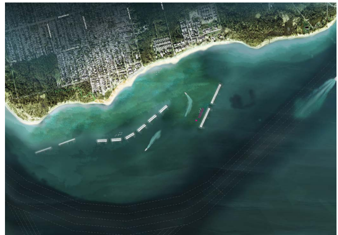
figure 2 Image from Living Breakwaters, (SCAPE, 2013)

At Columbia, we are working to address this gap by initiating a joint program between the Climate School and the Urban Design program. The aim is to emphasize that,