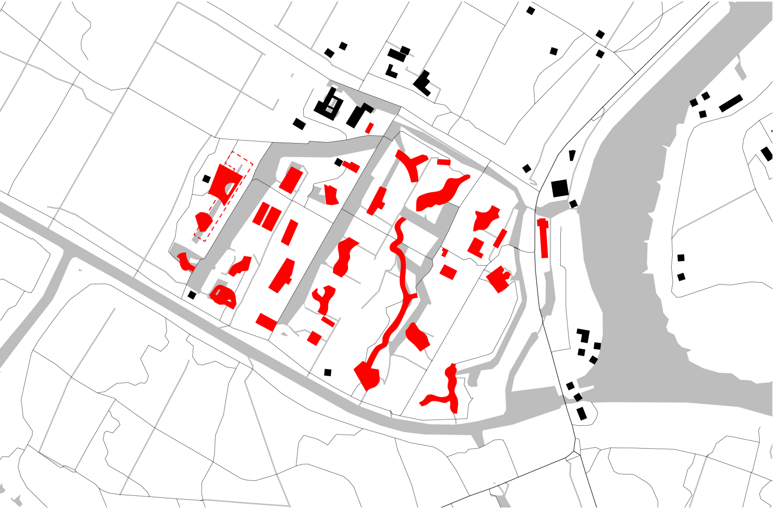
Waterloopbos Plan. Scale 1:8000

research tools were needed. During the 1940s, indeed, the Army Corporation of Engineers established the Mississippi Basin Model. It was built in Clinton, Mississippi; German prisoners of war deployed to move more than a billion cubic yards of earth to shape the river's geomorphology to scale: its tributaries, branches, channels, and bridges. In 1952, the Missouri River branch was operational and in use; in 1959, the entire model was completed, and the overall testing started. The engineers conducted trials to monitor and precast water levels and safety levels in the Mississippi basin for the purpose of further engineering projects, such as dams, flumes, pumps and reservoirs (Usace, 1971).