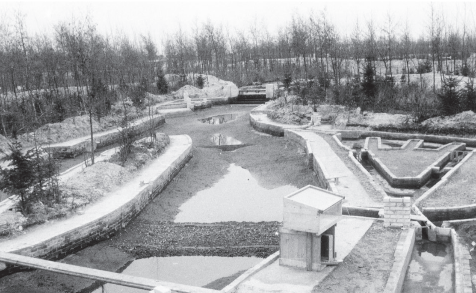
The model of the Water City part of Rotterdam. On the right the Binnenhaven and on the right Noordereiland, the middle is the river Maas (1956).