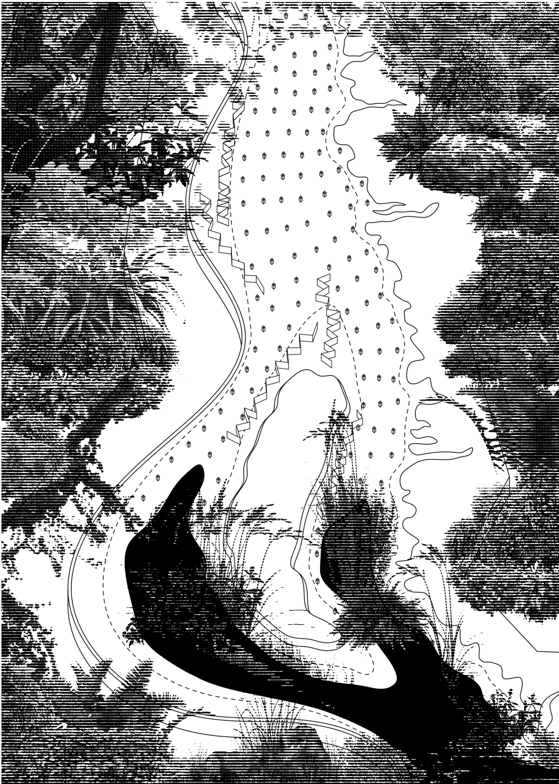
Cement dynamics, Mississippi Basin Model, 2021.

The figure shows the current status of a river branch of the Mississippi Basin Model. Here, tests were executed by hydraulic engineers to study the effects of the potential construction of dams, reservoirs, and levees on the larger inhabited territory. The morphology of the watershed was molded in detail in order to recreate the paleo-dynamics of the river water flows. But the cement panels of the model were a fixed impermeable surface that didn't meet the complexity of mixed earth, clay, rocks, sand of the original riverbanks. The engineers, then, resolved the issue adding, to the riverbeds, a series of metal plugs and, to the banks, rows of metal folded screens to simulate vegetation. Today, as shown in the axonometric projection, nature is taking its space creating – by contrast – living organic dynamics.