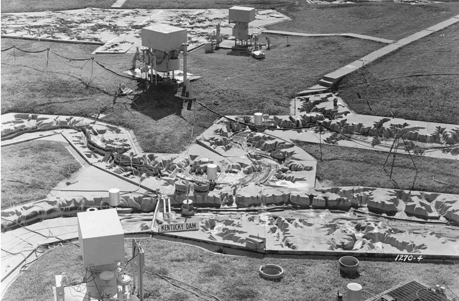
Mississippi Basin Model (vertical scale 1:100; horizontal scale 1:2000) looking upstream on the Ohio River from Evansville. In foreground the Kentucky and Barkley Dams (early 1970s).

tures on the riverine system. Here, only after the Great Flood of 1927, a new awareness started, and laid the basis for developing experimental scientific tools.