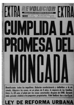
Fig. 1. Cuban Urban Reform Law

The issue of Cuban urban reform very rapidly entered the space of public debate in Brazil. Its initial manifestations in the newspapers 22 , in October of 1960, were informative. While coverage of the banner of struggle for urban reform was discussed more or less in-depth, the suppression of the real estate property regime and the suspension of evictions were highlighted. Soon, however, there were reactions against these measures, qualifying them as “crazy” and stating that another kind of housing policy was desirable. There were still those who justified the measures taking into consideration their intrinsic connection with the defense of the revolutionary process and with the popular support they gained, especially from the middle classes. Some months later, however, in May 1961, the issue had already been nationalized: a law proposed in congress 23 provided for the expropriation and sale of residential properties, transforming rents into amortization of the purchase 24 . The reaction to the proposed measure was immediate, both in terms of support and rejection, and the theme starts to guide a set of movements around the issue of urban reform in the country.