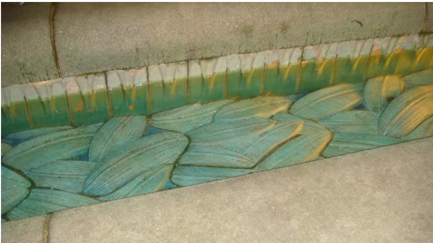
Fig. 2. Stone water feature in Peace Garden, Sheffield