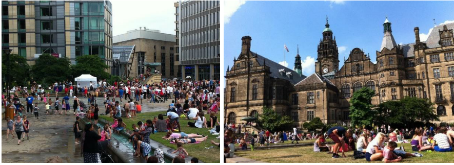
Fig. 3 & 4. People relax at Peace Garden in summer