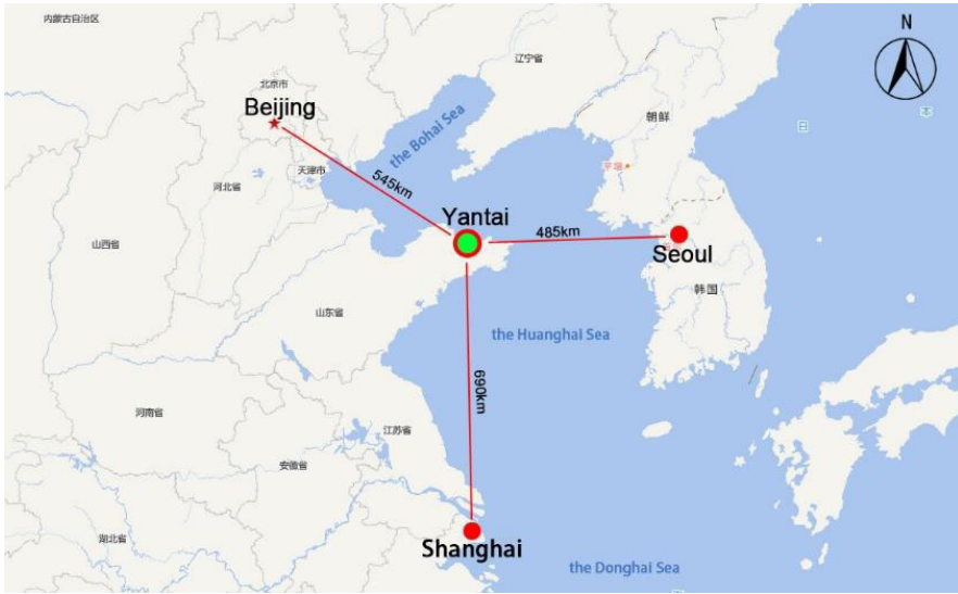
Fig. 5. Location of the city of Yantai