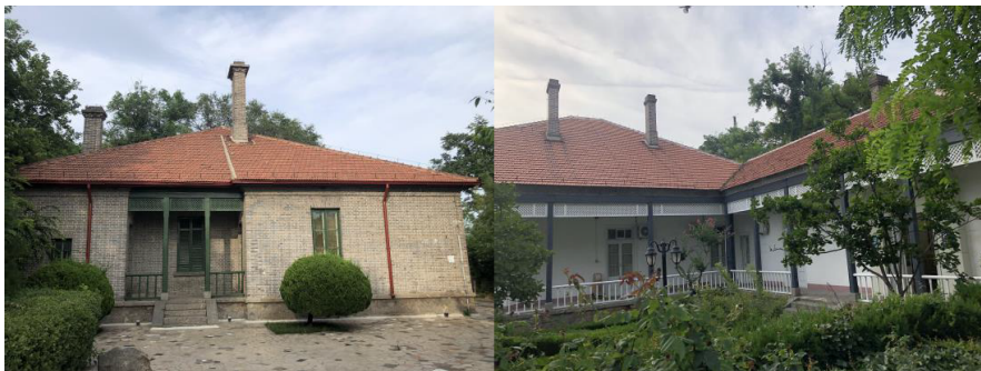
Fig. 6 & 7. Former British Consulate; Former East Customs Tax Department

From studies on Sheffield's heritage conservation experience, there are a few things that can be suggested on better integrating planning history research findings and heritage conservation work. It is more important to conserve the wider area than just a building when designating development plans. For example, the Sheffield City Centre Strategic Vision 2022 22 shows a plan of the city centre, illustrating six city character areas around the city centre (see Figure 8). In these character areas, the historic sites and cultural quarters are defined. Hence, urban heritage is conserved within the wider area that they are in. In these defined character areas, there are a number of good practice examples of urban heritage conservation such as the Kelham Island Industrial Conservation Area 23 . Kelham Island is one of Sheffield's oldest manufacturing sites and therefore proudly shows the city's industrial history, is now transformed into a vibrant and modern neighbourhood that presents an abundance of historic elements.