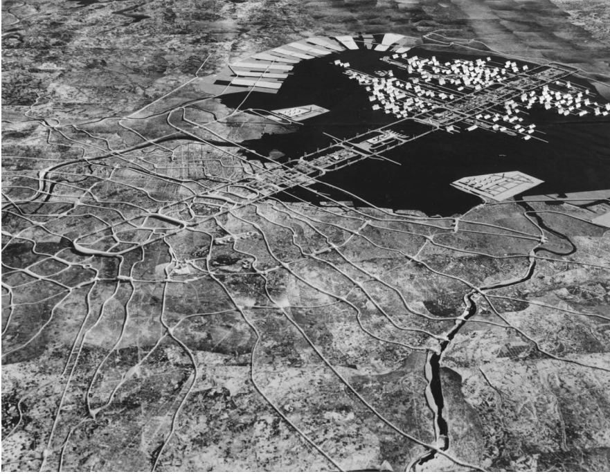
Fig. 2. Tokyo Plan 1960 by Kenzo Tange. The project was conceived as vast super-urban infrastructure designed around mass circulation systems for the linear expansion of Tokyo across Tokyo Bay.

At the same time, as an alternative to the decentralized model based on the redistribution of people and activities in a system of new towns proposed by the planners of the government, the project “Tokyo Plan 1960” proposed by architect Kenzo Tange emphasized instead the possibility of the city’s future expansion occurring on the bay. 16 The fundamental characteristic of the project was the divergence from the traditional radial pattern of urban growth, which dated since the foundation of Tokyo, and the proposition of a linear model of development across Tokyo Bay along major vast and multi-level arteries of circulation. Tange proposed to convert the core of the city from a “civic centre” to a “civic axis”. Tange’s Tokyo Plan highlighted the importance of mobility channels based on mass-transportation systems and massive and huge structures of suspended bridges and artificial floating platforms, Plan for Tokyo was a substantial deepening of a study started with the research experience of Tange himself at MIT of Boston in 1959 and further refined during his association with the Metabolists.