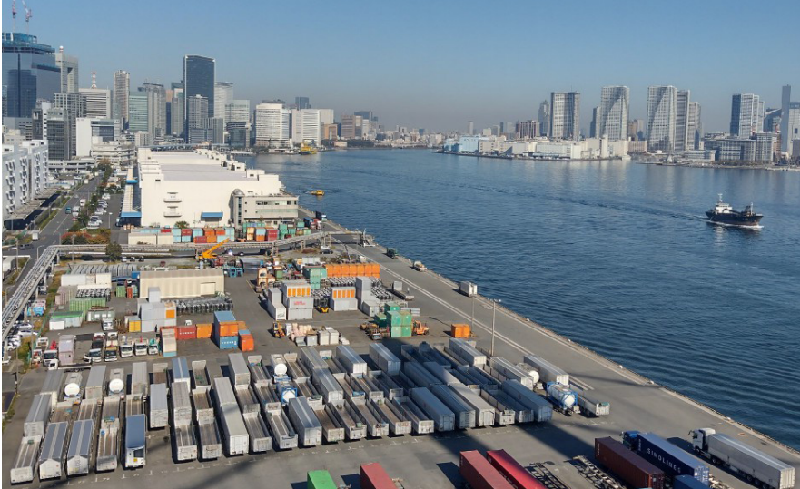
Fig. 3. Recent development of Tokyo Bay waterfronts. Old industrial spaces are progressively removed and converted into new residential complexes filled with high rise towers and green amenities.

and comprehensive urban master planned office, leisure and commercial enclaves fundamentally intended for a consumerist society (but also flagship of international corporations, and municipal or national governments expressions of their various local and global ambitions), which especially from the middle of the 1980s were sponsored and supported by means of capitals from many public corporations and private companies.