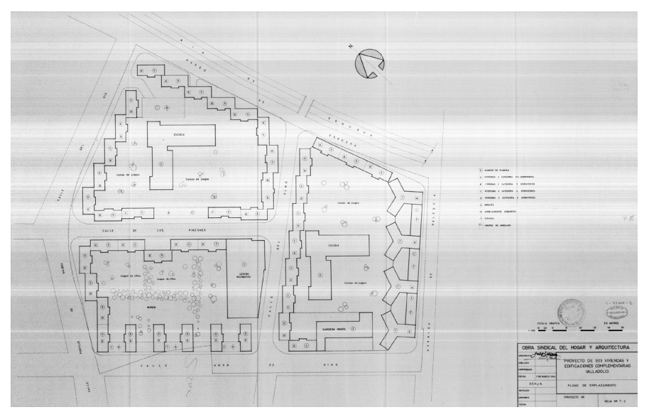
Fig. 4. Site plan of the Grupo XXV Años de Paz. Valladolid, 1964.

The initial housing project of the OSH did not eventually materialize, but the building charity Francisco Franco of the province of Soria elaborated in 1953 a new project for 56 "rural" subsidized houses and plots for 72 more possible units. They were one-storey semi-detached houses with around 58 m2, including living room, kitchen, toilet and three bedrooms, together with units for animals, feed and manure, in plots from 180 to 210 m2. The project proposed a new neighbourhood, called Barrio de San Matías , which was separated from the original settlement of Covaleda by a thalweg. A curvilinear road structured several pedestrian and carriage ways giving individual access to each residential plot. Other plots were reserved for green areas, a public building in a central position, a chapel and a children's home. Before this project materialized, it passed to the OSH. A new report in 1957 identified the houses as "limited income, 2nd category" and considered a church, a market and schools as facilities, "which will not be projected for now". The auction for its construction was published in October 1958, which was concluded in March 1962 after some modifications in materials and budget.