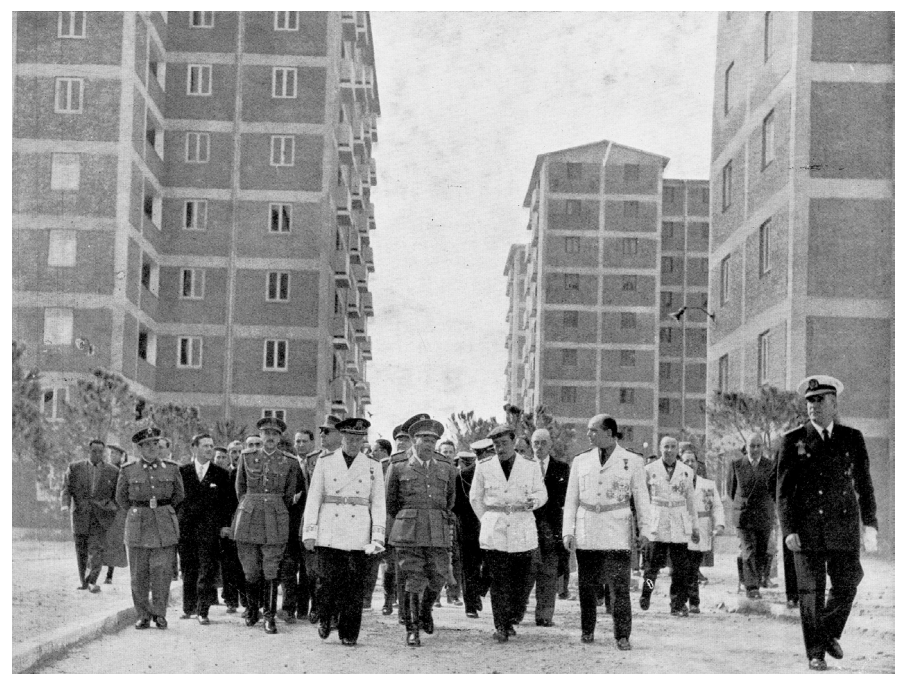
Fig. 1. Inauguration of a residential group in Madrid in the fifties by the authorities, led by the Head of State, the General Secretary of the "Movement", the National Delegate of the DNS, the General Director of the INV and the National Head of the OSH.

In 1950, the DNS reported on its activity up to July 18th, 1949—after ten years of the so-called "New Spain"—. It had built 198 housing groups with a total of 9,800 housing units. In addition, 215 groups were under construction with a total of 15,759 housing units; 49 other groups with 1,500 units were in the auction period and 325 groups with 20,240 housing units were in project or in preliminary stages. 16 Out of this rough amount, 48,299 housing units, only 9,800 of them had been handed over in those ten years of operation, that is, one third of the already built units and far below the real needs, which were counted by several hundred thousand. 17 In contrast, no less than 5,600 propaganda events, 85 visits by foreign personalities, 204 key handovers events and 450,000 propaganda brochures had been made. 18