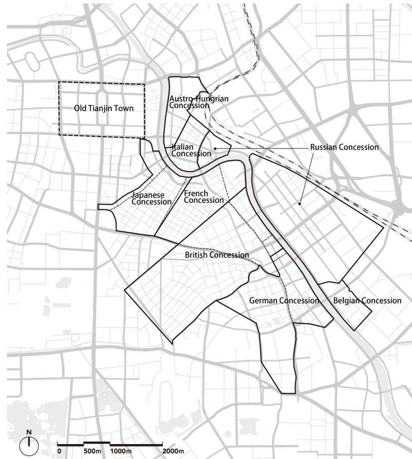
Figure 1. The old Tianjin town and nine foreign concessions on map of Tianjin. The concessions were all located outside the old Tianjin city, along Hai-Ho river (海河).

The nine foreign concessions in Tianjin were all located near the Hai-Ho river, convenient for trade and transport. Almost all of the concession areas were undeveloped at the beginning of their establishment. In the words of the editor of the Chinese Times , Alexander Michie, the beginning of the first two concessions, the British and the French, were “foul and noxious swamps, around them, on the dryer grounds, were the numerous graves of many generations of people”. 4