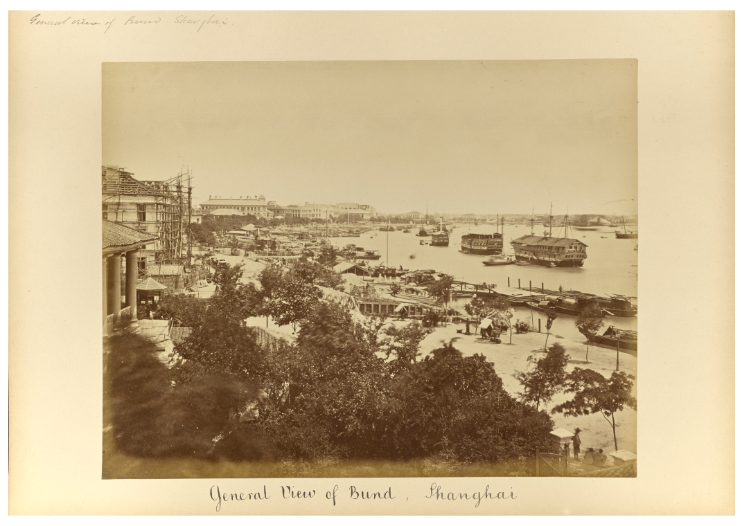
Figure 4: General view of Bund, ca. 1870. Courtesy of the Getty Museum in Los Angeles [object no.: 84.XO.1356.17]. Available at: http://www.getty.edu/art/collection/objects/208307/unknown-maker-general-view-of-bund-shanghai-about-1870/ [20 March, 2018]