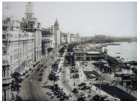
Fig.3 Bird's-Eye view of the cluster along the Bund in 1930

In the early opening times, the couch-style that came from Europe to the Southeast Asia became the main style in Shanghai. At the beginning of 1860s, the foreigners began to hire some skilled architects for designing, and imported materials from overseas. The Bund was “full of gorgeous buildings”, Some of the buildings were imitated Greek temples, and some were imitation of the royal palace of Italy. In the 1920s, Chinese architects began to explore the modern architectural design in Shanghai. Although the Chinese architects mastered the western modern architecture technology and skills gradually, the design style was still subjected to conservative traditional ideology. For example, Dong Dayou used the traditional Chinese roof on the top of a Western-style building, try to build a symbol of government authority and stability (Figure 3). In the 1940s, the American modern style became the mainstream style.