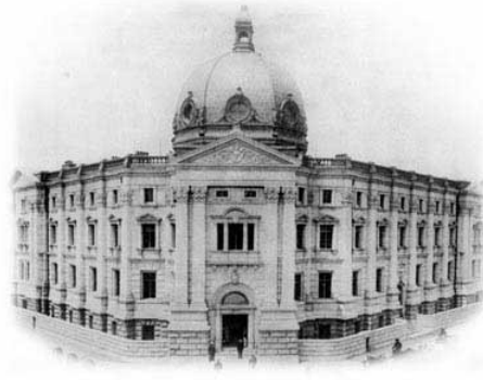
Fig.6 Yokohama Specie Bank Ltd