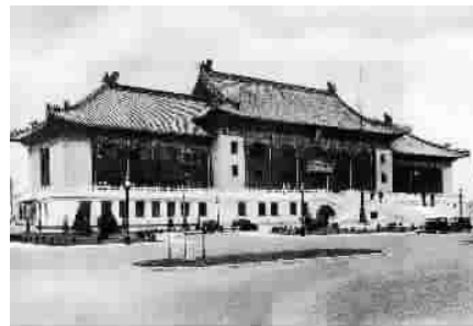
Fig.4 National Shanghai Municipal Government Building

At the beginning, Yokohama was built in a traditional Edo style. After the opening, buildings began to appear strong western style, especially in the Yamate and Yamashita settlements, buildings were designed by foreign architects, “Renaissance”, “Gothic”, “Baroque” and other styles appeared Simultaneously. Yokohama became the source of westernization in Japan. After the Meiji Restoration (1868), the open social environment created a background for architectural development. “Imitate the western style” was prevailed in the Japanese folk 3 . At the end of the 19th century, the modernist architecture emerged. The native Japanese designers mastered the orthodox form of western architecture, and soon there emerged a large number of architects, such as Yamaguchi Hanroku, Tsumaki Yorinaka and so on 4 . In 1904, the Yokohama Specie Bank Ltd designed by Tsumaki Yorinaka was built in Yokohama, the building was New-Baroque style (Figure 4). Yokohama gradually became a laboratory of the modern style.