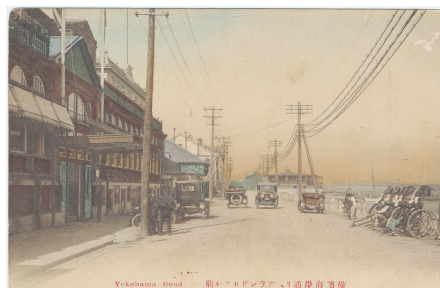
Fig.5 Yokohama Bund in front of the Grand Hotel

At the beginning, Yokohama was built in a traditional Edo style. After the opening, buildings began to appear strong western style, especially in the Yamate and Yamashita settlements, buildings were designed by foreign architects, “Renaissance”, “Gothic”, “Baroque” and other styles appeared Simultaneously. Yokohama became the source of westernization in Japan. After the Meiji Restoration (1868), the open social environment created a background for architectural development. “Imitate the western style” was prevailed in the Japanese folk 3 . At the end of the 19th century, the modernist architecture emerged. The native Japanese designers mastered the orthodox form of western architecture, and soon there emerged a large number of architects, such as Yamaguchi Hanroku, Tsumaki Yorinaka and so on 4 . In 1904, the Yokohama Specie Bank Ltd designed by Tsumaki Yorinaka was built in Yokohama, the building was New-Baroque style (Figure 4). Yokohama gradually became a laboratory of the modern style.