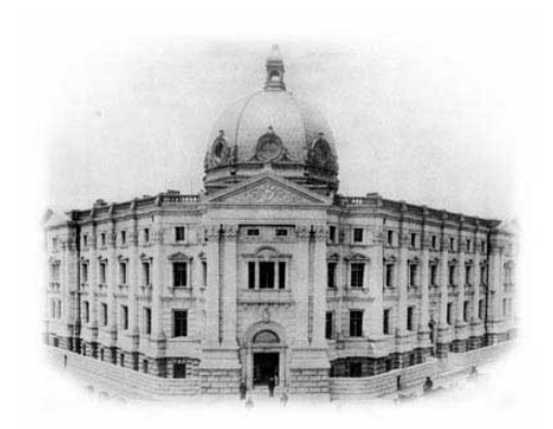
Fig.6 Yokohama Specie Bank Ltd