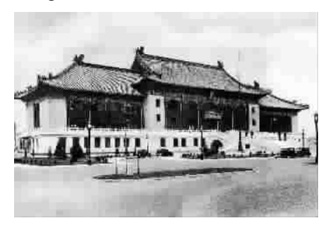
Fig.4 National Shanghai Municipal Government Building

At the beginning, Yokohama was built in a traditional Edo style. After the opening, buildings began to appear strong western style, especially in the Yamate and Yamashita settlements, buildings were designed by foreign architects, "Renaissance", "Gothic", "Baroque" and other styles appeared Simultaneously. Yokohama became the source of westernization in Japan. After the Meiji Restoration (1868), the open social environment created a background for architectural development. "Imitate the western style" was prevailed in the Japanese folk<sup>3</sup>. At the end of the 19th century, the modernist architecture emerged. The native Japanese designers mastered the orthodox form of western architecture, and soon there emerged a large number of architects, such as Yamaguchi Hanroku, Tsumaki Yorinaka and so on<sup>4</sup>. In 1904, the Yokohama Specie Bank Ltd designed by Tsumaki Yorinaka was built in Yokohama, the building was New-Baroque style (Figure 4). Yokohama gradually became a laboratory of the modern style.