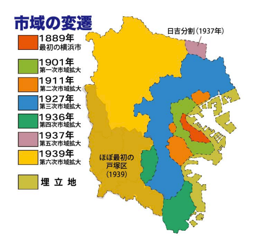
Fig.2 The Extended map of Yokohama

If the "opening" transformed Shanghai from a general town that located in the empire's border into a world-class metropolis, the Yokohama's "opening" meant "the emerge of the city". "Yokohama was a semi farm and fishing village. The hogunate intended to catch up with the date of Port-Opening and stepped up the construction of the city<sup>2</sup>". In 1858, The Treaty of Peace and Amity stipulated the opening of the five ports. However, the Tokugawa shogunate decided that port facilities should be built in Yokohama instead. And the "customs house" was rented to the foreigners. In the early Meiji period, Yokohama developed into a prosperity modern city. In 1889, Yokohama built the city, and mainly around the port area of Kannai, Yamate and Yamashita (Figure 2). Subsequent decades, the Kanto Earthquake and US Air Raids slowed the pace of urban expansion.