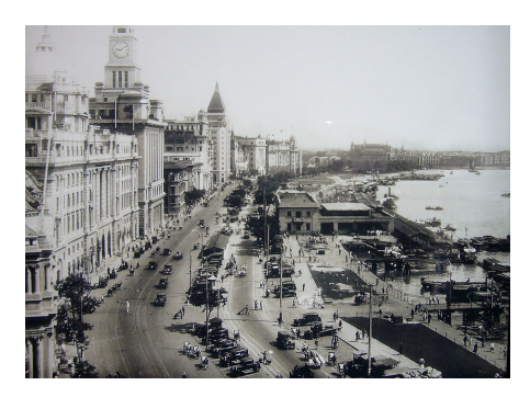
Fig.3 Bird's-Eye view of the cluster along the Bund in 1930

In the early opening times, the couch-style that came from Europe to the Southeast Asia became the main style in Shanghai. At the beginning of 1860s, the foreigners began to hire some skilled architects for designing, and imported materials from overseas. The Bund was "full of gorgeous buildings", Some of the buildings were imitated Greek temples, and some were imitation of the royal palace of Italy. In the 1920s, Chinese architects began to explore the modern architectural design in Shanghai. Although the Chinese architects mastered the western modern architecture technology and skills gradually, the design style was still subjected to conservative traditional ideology. For example, Dong Dayou used the traditional Chinese roof on the top of a Western-style building, try to build a symbol of government authority and stability (Figure 3). In the 1940s, the American modern style became the mainstream style.