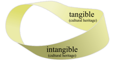
Figure 1: A unity of opposites: tangible (cultural heritage) and intangible (cultural heritage).

Tangible and intangible are a unity of opposites, so are tangible cultural heritage and intangible cultural heritage. Conventional conservation approach tends to separate them. For the former, especially the historic districts, the most important thing is to protect the texture of the old city formed hundreds of years ago, as well as the streets and alleys with friendly human scale. For the latter, the treasures are actually those real-life memories of the local residents as if had been integrated into their bone marrow and blood. In fact, communities do not compartmentalize heritage as tangible or intangible. It does not make sense to update the material space without considering human needs. Besides, without the tangible carriers like human beings, certain intangible heritages cannot be dependent and vice versa. Therefore, in this paper, the author hopes to integrate the perceived dichotomies through the interaction between tangible and intangible.