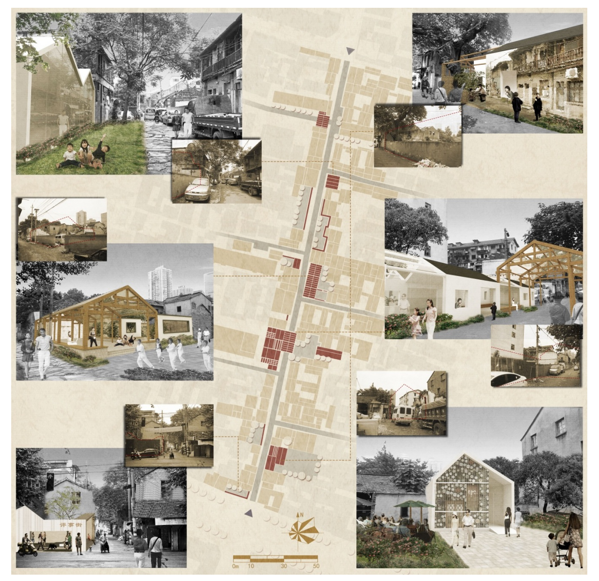
Figure 2: Public Space Renovation Plan for Pingshi Street.