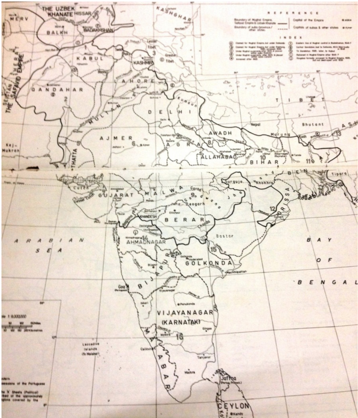
FIGURE 2 Map of India in 1601

industry. So, the industrial cities attracted more merchants, shopkeepers, grain dealers, clerks, brokers, transport personal ,servicemen and so on.