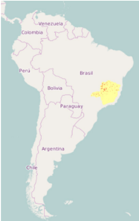
FIGURE 1 The State of Minas Gerais,