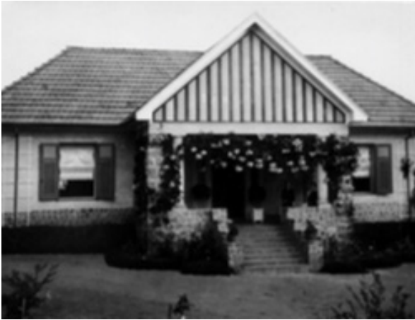
FIGURE 4 The Chacara das Rosas in the city of Cambuquira, about 1940.