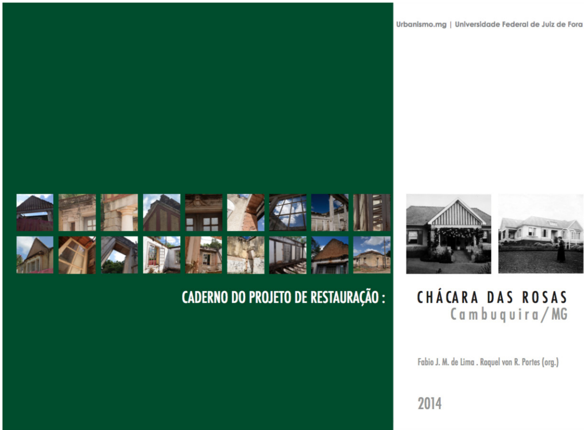
FIGURE 6 The Project Restoration (the book cover) to the Chacara das Rosas in the city of Cambuquira.

Therefore the intents is to define appropriate guidelines for the Chacara considering also the reconstruction of the roof in the sense “ com’era, dov’era ”. The guidelines also include a new interior design to allow reuse as a municipal Cultural Centre. The first aspect is linked to social memory by this reminder of the building as a cultural reference for locals and visitors. The second aspect, which overlaps the first, has the sense of allowing the new use for cultural purposes and their integration to the current city life. These guidelines include technical discussions within the Municipality, particularly the Department of Culture as well as the Municipal Council of Culture. The demands raised in these discussions have been included in the process which also had partial presentations of the project.