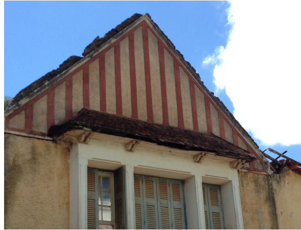
FIGURE 5 The ruins of Chacara das Rosas in the city of Cambuquira, about 2014.

In the early 2000s the City Hall was transferred for the Globo hotel in the vicinity which had been acquired by municipality. Then the Chacara was abandoned and remained unused which led to their gradual degradation. During this period in 2002 the administration of the Mayor Rubens Santos Barros wrongly aggravate the deteriorating condition of the building with the complete removal of the roof. Thus the building was exposed to inclement weather. All its components like frames, doors, windows have accelerated deterioration. At the same time in the immediate surroundings of the building inadequate structures were implemented which changed the original characteristics of the Chacara . Much of the trees that formed the rich orchard and garden were destroyed for the inclusion of other buildings. So they were inserted at the top a school with sports court, beside the arbor side a low building that currently houses the municipal pharmacy and at the bottom, where there was a direct access to the garden and fountain, a health complex on two floors with monumental ramp practically leaning against the facade of this side of the Chacara .