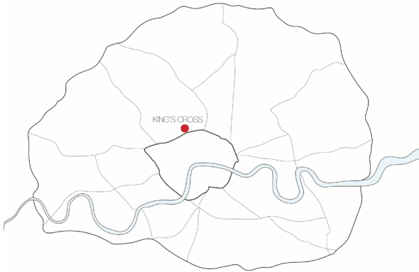
FIGURE 1 King's Cross position in the fringe of central London.