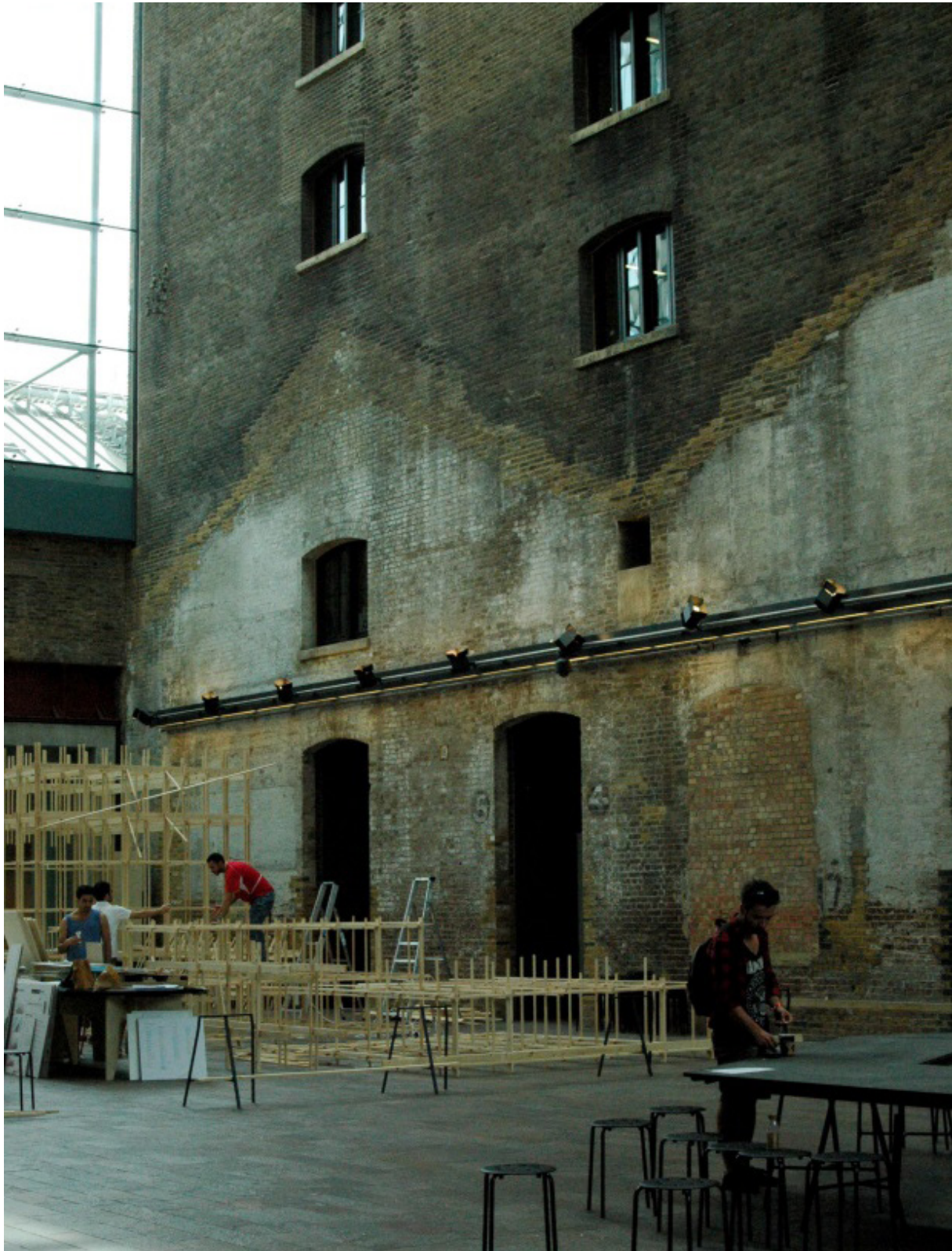
FIGURE 4 Interior view of the Granary Complex. The historic complex has been transformed sympathetically, preserving the patina and traces of demolished parts.