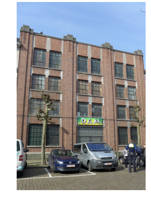
17 1929 Boerenbond Between 34 and 36, De Pretstraat

FIGURE 3 Overview of the seventeen most significant warehouses and nations in the goods station district