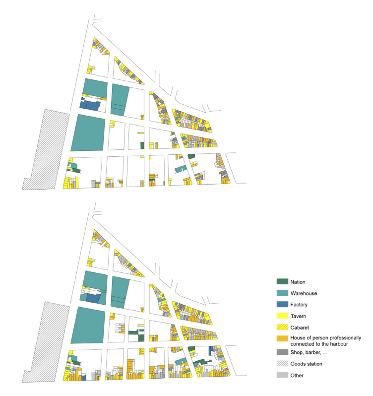
FIGURE 2 The goods station district has a mixed residential and industrial character: 1888, below: 1900.

Many nations and traders divided their warehouses in smaller entities to be rented to different tenants. The stored goods in the station district were divers. Many warehouses stored flammable goods such as coal, leather, animal skins, horns, wool, copal, rubber, gum and naphtha, as well as straw and hay. Some also stored grains, seeds and legumes. Brussels' warehouses built in the 19th and 20th century often had specific characteristics depending on the materials that needed to be stored.<sup>20</sup> This has not yet been observed in this Antwerp's district. The handling companies did specialise in specific goods<sup>21</sup> and rented to tenants of the same sector, although they also rented their warehouses for the storage of other kind of goods. As opposed to the Brussels' warehouses, Antwerp's warehouses had multifunctional constructions suitable for a wide range of goods.