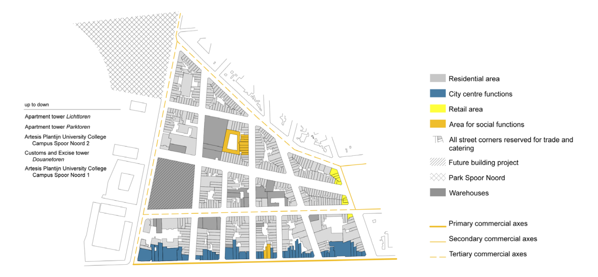
FIGURE 4 The RUP 2060 sets strong guidelines for the further development of the district

The impact of the RUP 2060 on the still existing warehouses is analysed to foresee which problems can occur with respect to the safeguarding of the warehouses and their specific characteristics. RUP 2060 focuses on five main principles: stressing the residential character of Antwerp-North and the necessity of a variety of housing typologies, defining strategic commercial axes, taking measures to increase green space, stimulating entrepreneurship and pinpointing project areas for strategic impulses.