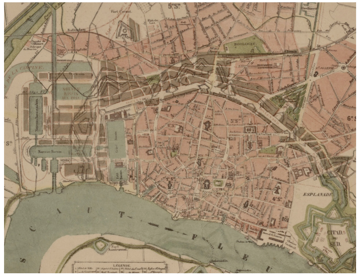
FIGURE 1 The new building blocks are indicated in dark brown and follow the traces of the 16th-century city walls. The new goods station (1874) is not yet drawn on the map.

Between 1859 and 1864 a new polygonal fortification system, the so-called Brialmont fortification, was built at a distance of 2 to 2.5 km from the 16<sup>th</sup>-century city walls.<sup>8</sup> The old fortifications were demolished shortly afterwards. The former military engineer Théodore Van Bever (1821-1875) created a master plan for the newly achieved urban space. The attached mémoires states that "the development of the port activities is the main goal", thus to compete with other harbours like Amsterdam and Hamburg. The plan also included a semi-circular boulevard around the city, the so-called "leien", based on the traces of the former city walls. The urban area along the boulevard was divided in building blocks by a grid of straight streets and sold to the Société Immobilière d'Anvers, which divided them into parcels to sell. Additional streets and buildings quickly filled the remaining area up to the Brialmont fortifications.<sup>9</sup> (fig. 1)