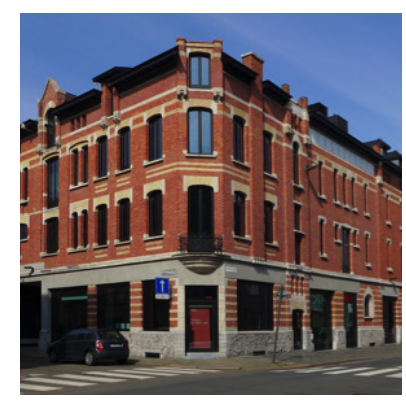
16 1906 Headquarters Valkeniersnatie