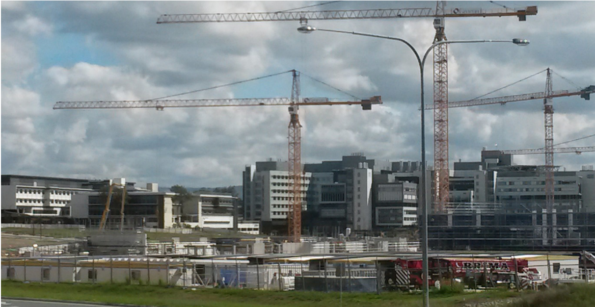
FIGURE 3 Gold Coast Health and Knowledge Precinct (GCHKP) under construction adjacent to Gold Coast University Hospital in 2016. The precinct will initially be used as the Commonwealth Games Village when the Gold Coast hosts the Games in 2018.