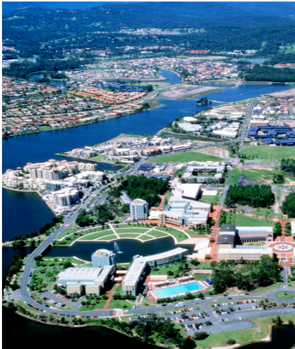
FIGURE 1 Bond University and Varsity Lakes