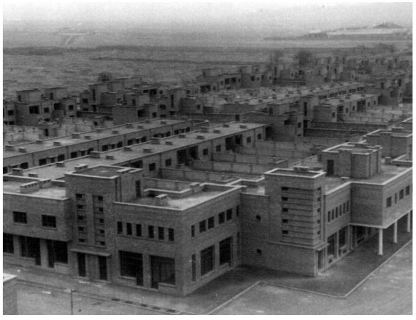
FIGURE 2 Chaharsad Dastgah housing project, Tehran-Iran. The photo shows the project in its just after its completion in 1946.