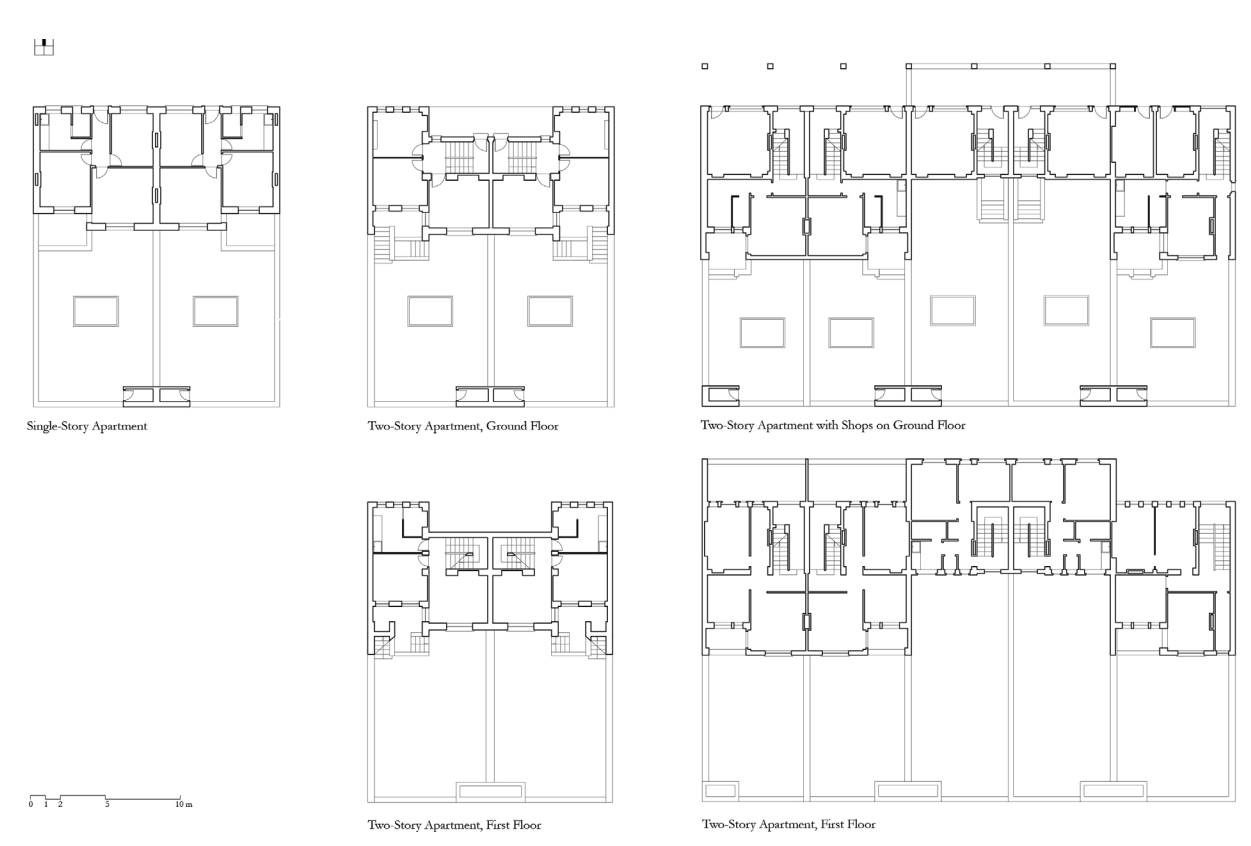
FIGURE 3 Plans of Three Housing Typologies in Chaharsad Dastgah.