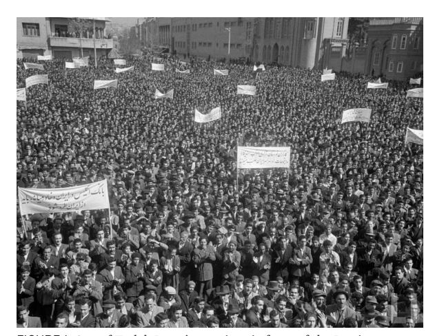
FIGURE 1 One of Tudeh Party's meetings in front of the Iranian Parliament (Baharestan Square) Tehran-Iran, 1951.