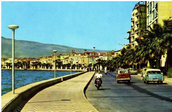
FIGURE 5 3-4 storey apartments and 8-9 storey apartments in 1950s.