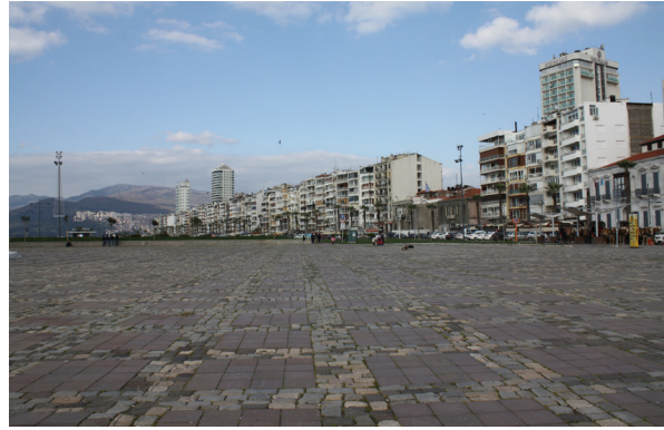
FIGURE 4 Present day view of Kordonboyu. Ground floors are in use for commercial activities and higher floors are for residential purpose.