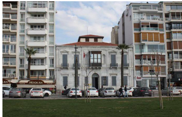
FIGURE 6 A Levantine House between 8-9 Storey Buildings.