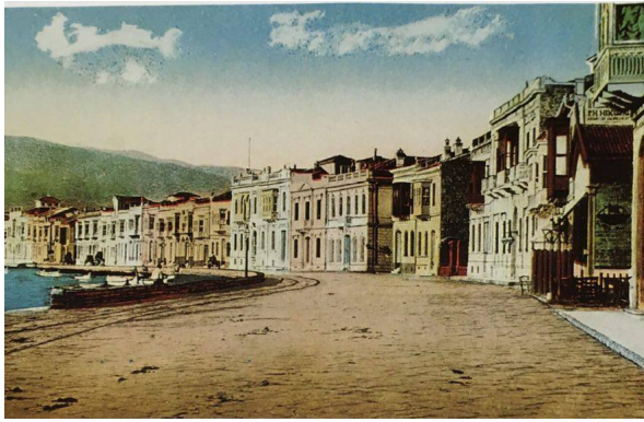
FIGURE 3 Belle Vue in 1910s. The buildings were not for commercial uses. There were not even a single building for commercial uses between Punta and Belle Vue.