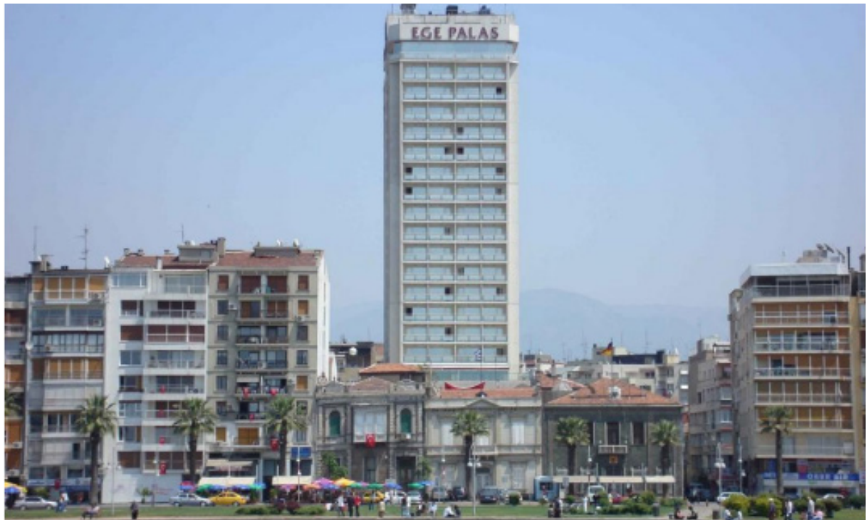
FIGURE 7 A High-rise building behind Levantine Houses.