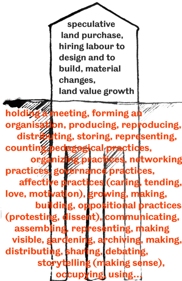
Fig. 2: Illustration of practices of participation as the hidden supports of building as capitalist accumulation. Illustration: author.