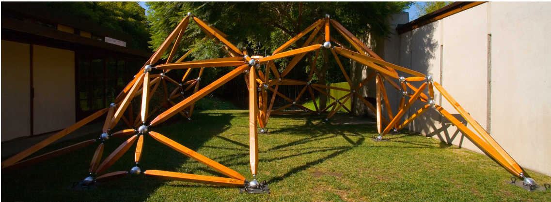
Fig. 4: Open Source Architecture, the Hylomorphic Project, 2006, Mak Center, West Hollywood, CA, 2006.