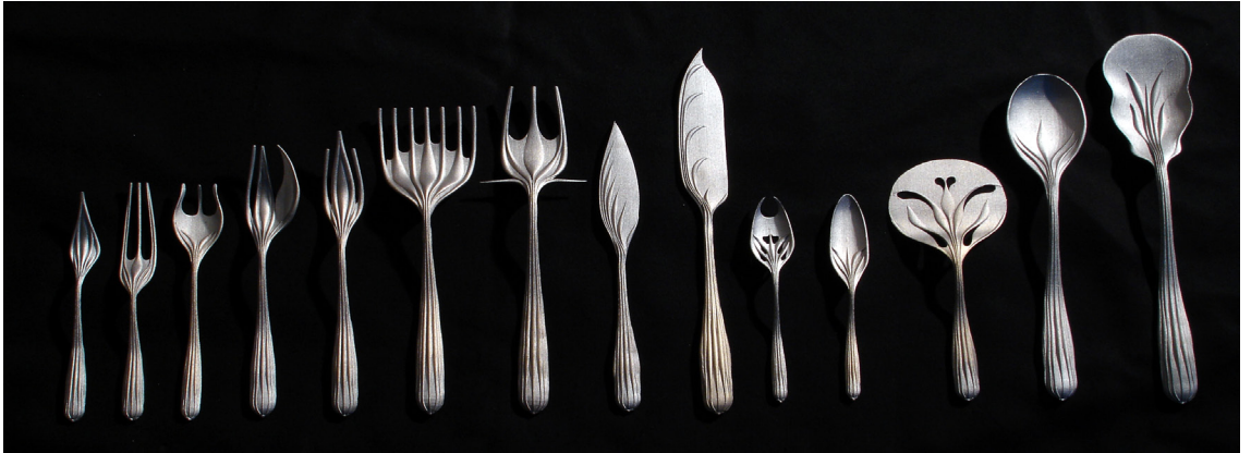
Fig. 3: Greg Lynn, GLForm, Flatware, 2007.