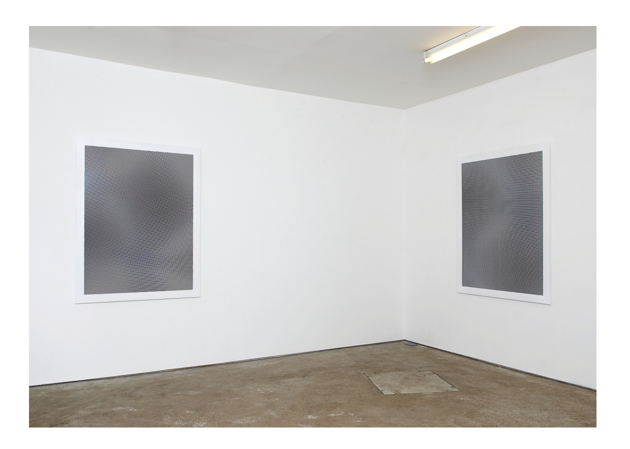
Fig. 4: Liz Deschenes, Installation view of Photographs , 2007, Campoli Presti, London.