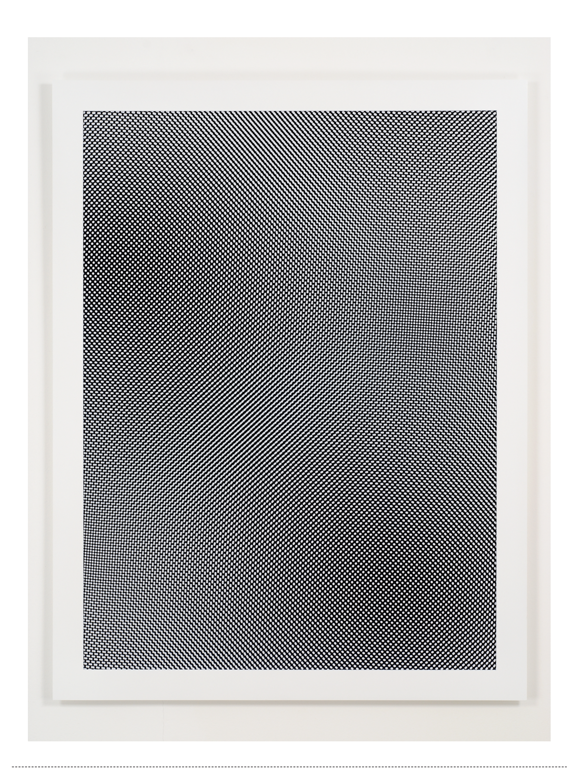
Fig. 3: Liz Deschenes, Moiré 11 , 2007, unique photographic print, 60 \times 46 inches (152.4 x 116.8 cm) framed, Miguel Abrieu Gallery, New York