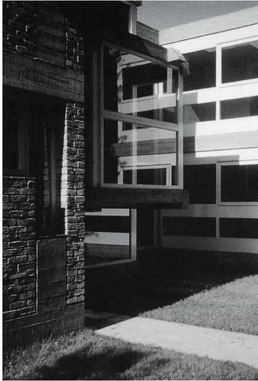
Fig. 1: James Stirling & James Gowan, Ham Common apartment, London, 1958.