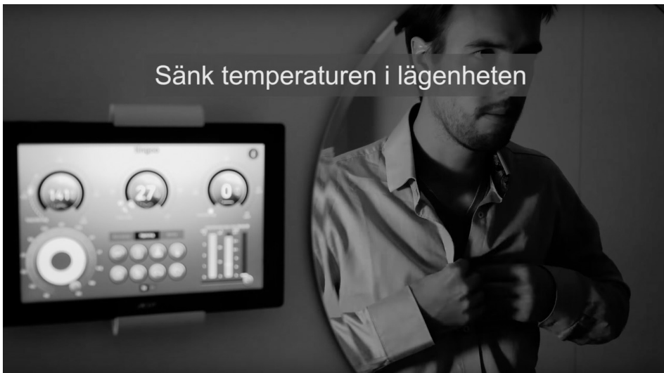
Fig. 5: The test family in the first phase of The Active House. Originally published in Dagens Nyheter , 21 March 2013.