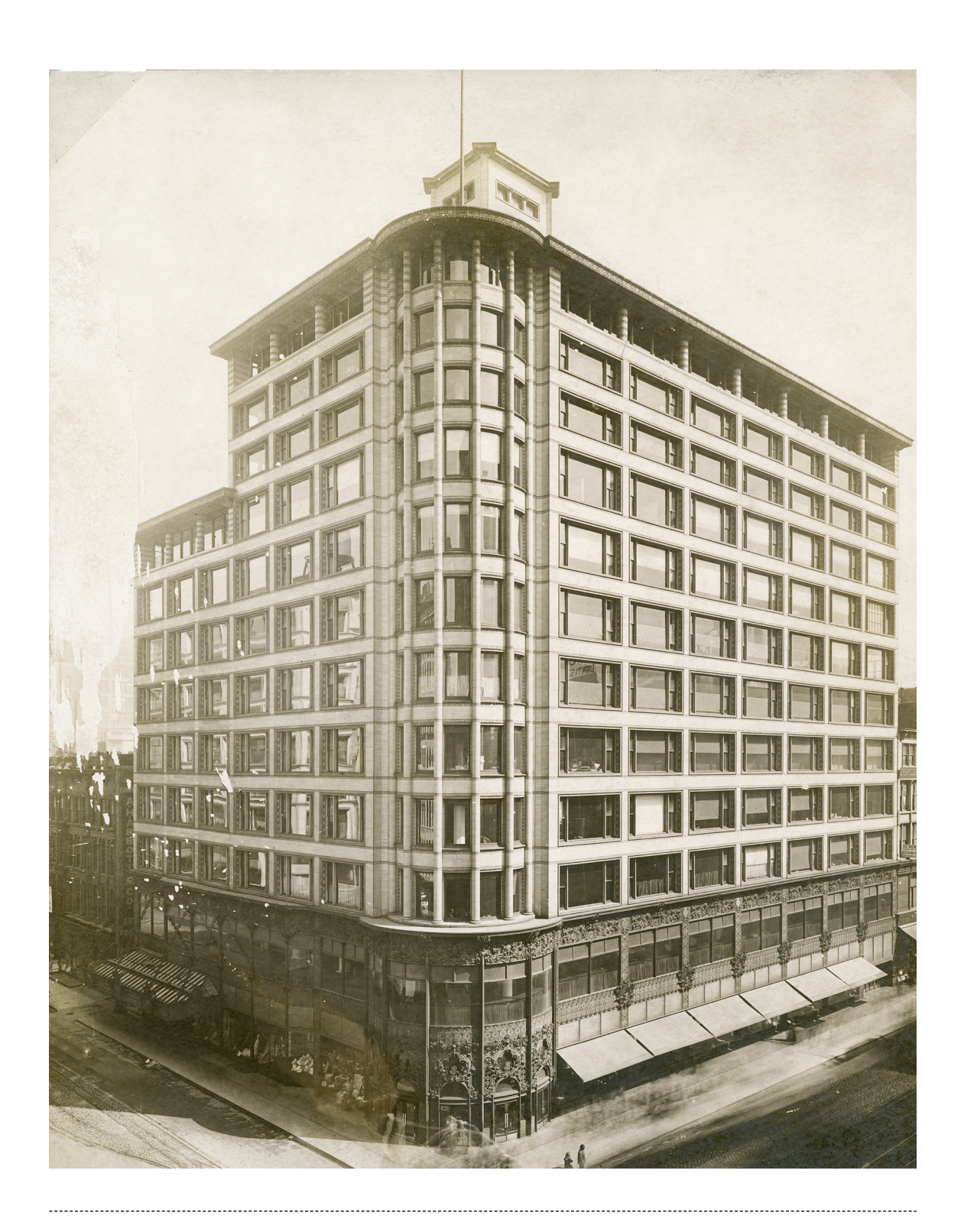
Fig. 1: Carson Pirie Scott and Company Store, Chicago, IL, 1899, 1903. Louis H. Sullivan, architect.