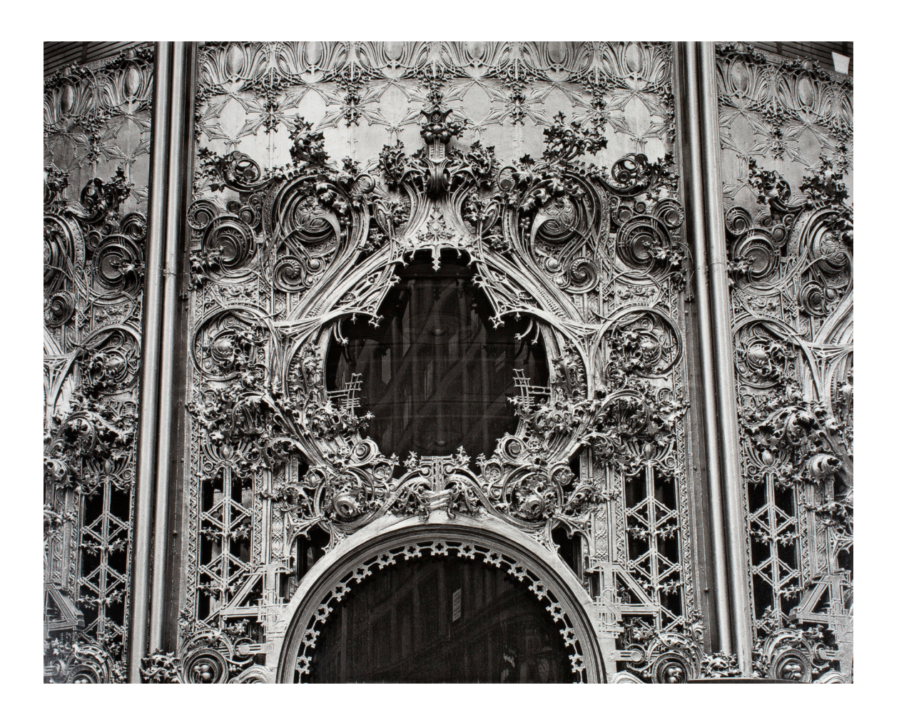
Fig. 5: Façade detail of the Carson Pirie Scott and Company Store, Chicago, IL, 1899, 1903. Louis H. Sullivan, architect.