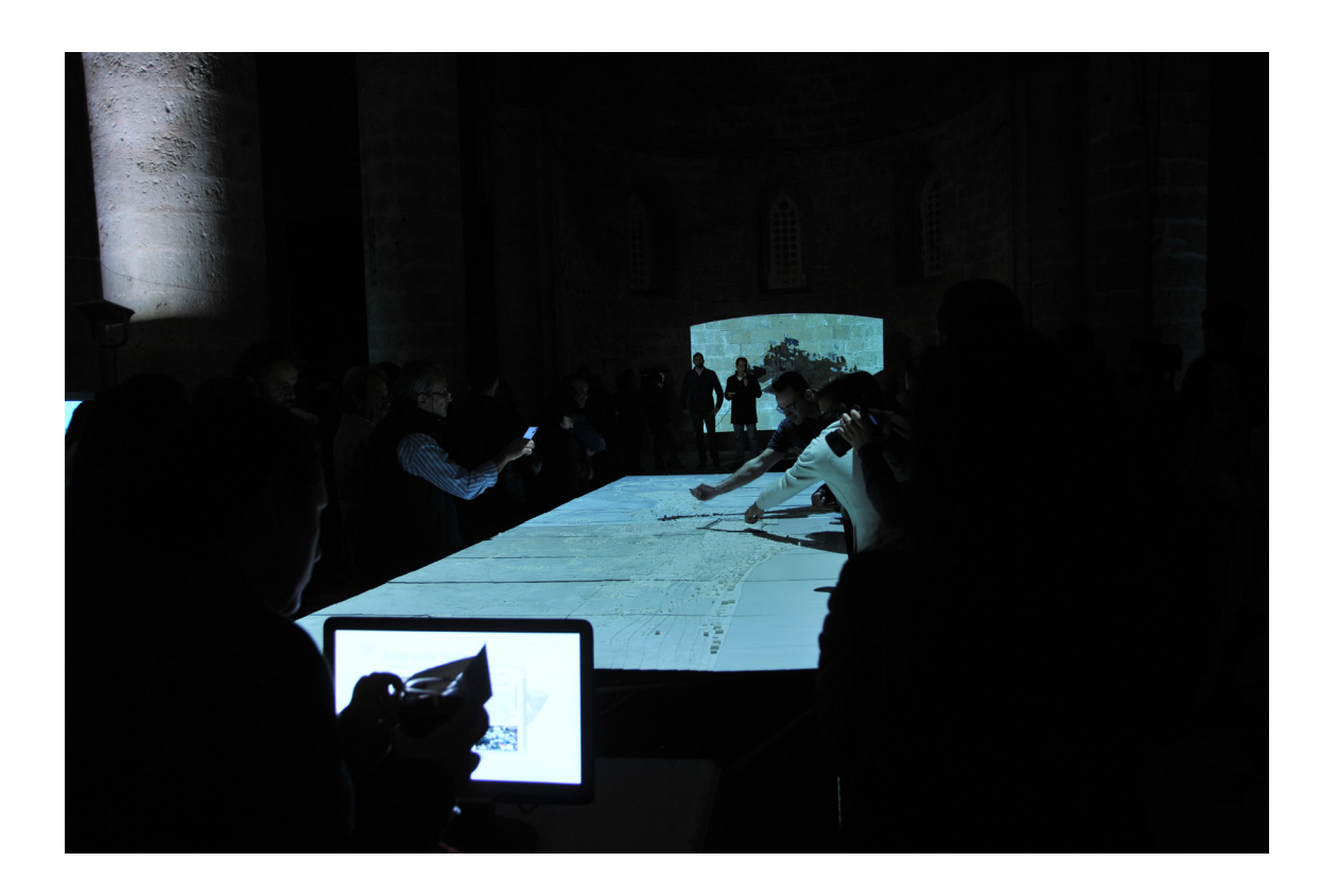
Fig. 3: The portable physical model as a material agent for reconciliation, courtesy of Hands-on Famagusta .