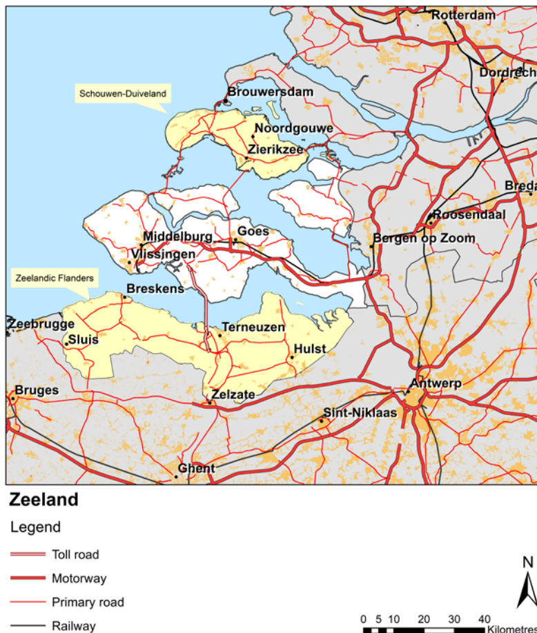
Figure 2. Study areas and their topographical context

but is only operated if it has been reserved at least one and a half hours in advance. This 'bus taxi' service also replaces the regular bus services during weekends.