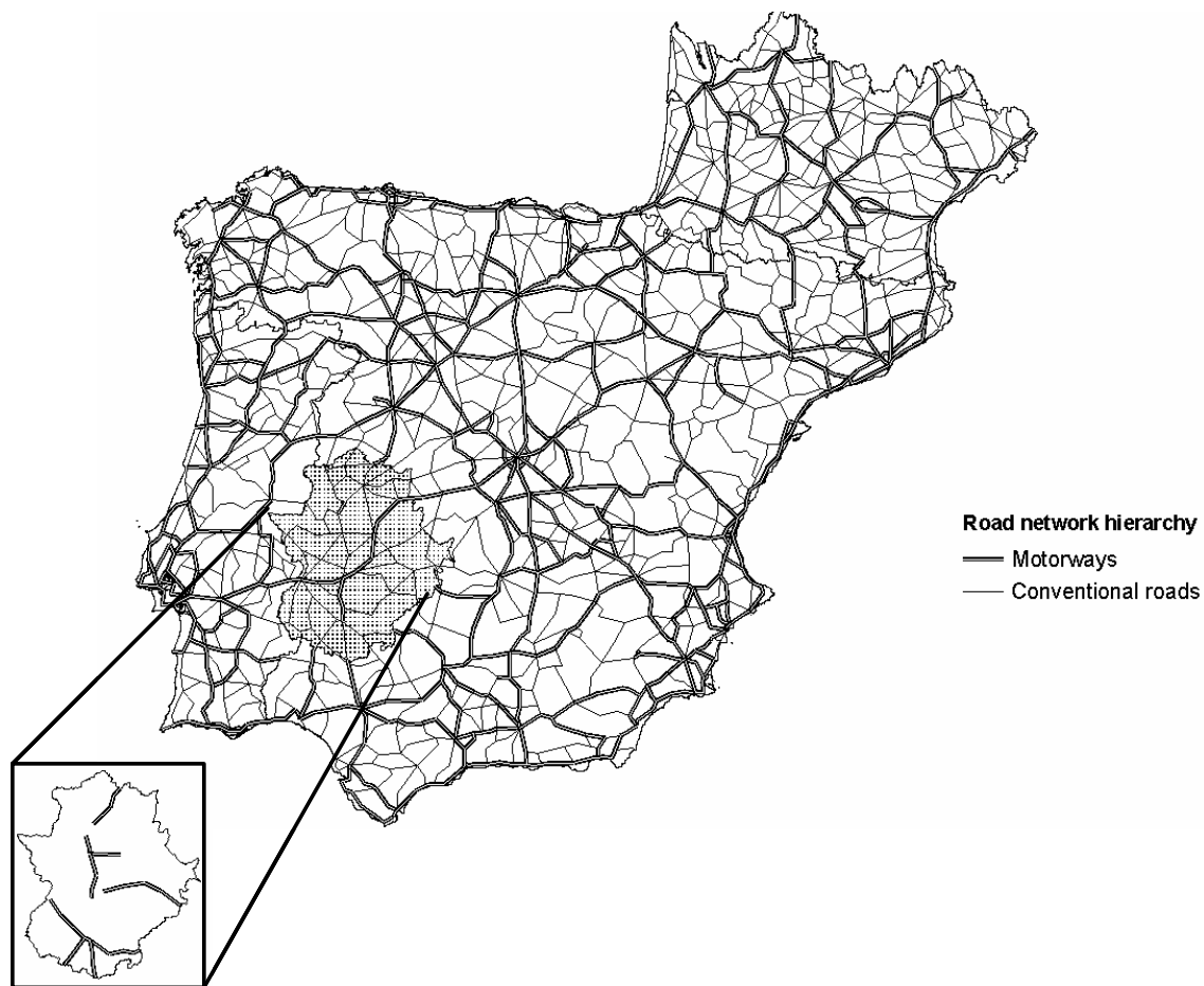
Figure 3. The regional extraction method (example of the extraction of the new motorways planned for Extremadura)

For each of the 17 scenarios, the study area was divided into 815 transport zones with their respective centroids. This large number of zones was justified because accessibility indicators were more accurate and realistic than if other aggregated spatial units, such as provinces (47) or regions (15), had been used. Besides, it was necessary to correct the problem known as self-potential - which refers to how much the internal accessibility of each zone contributes to total accessibility - discussed in Bruinsma and Rietveld (1993) and Frost and Spence (1995). If not corrected, self-potential problems can bias the results of accessibility measures, most strongly in zones that are highly populated or have a large area.