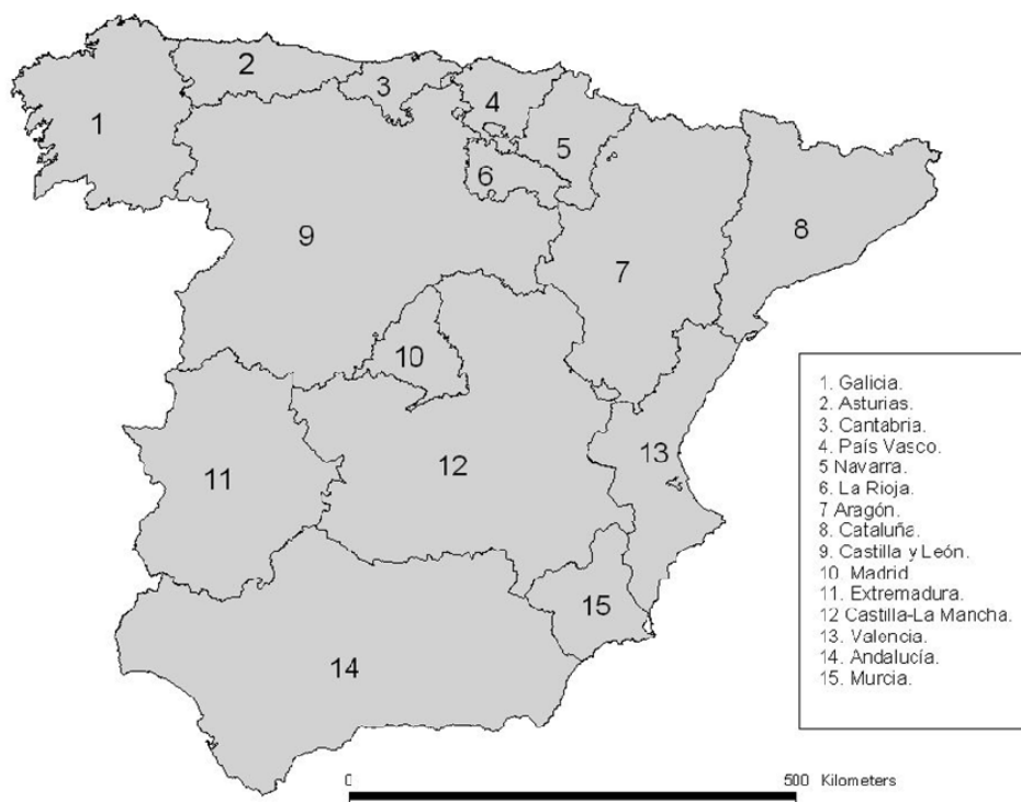
Figure 2. Spanish autonomous regions

The GIS model includes the main road network of the 15 Spanish peninsular regions (Figure 2), Portugal and the South-Western French regions (Aquitaine, Midi-Pyrénées and Languedoc-Roussillon) for 17 different scenarios - 2005 (ex-ante plan), 2020 (ex-post plan) - and 15 scenarios for 2020 without considering regional investments in region i . Thus, regional spillovers from new motorway investments foreseen in the PEIT are calculated according to the net gains on accessibility (measured by economic potential 6 ). The accessibility gains are obtained using the regional extraction method (Figure 3). The logic behind this procedure resembles the works that use the extraction method on the basis of an input-output table with multiple regions. In order to consider the isolated effects of a hypothetical region i , it is usual to extract the region under analysis from the multiple-region model (Dietzenbacher et al. , 1993).