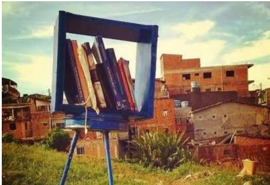
FIG. 1.2 Picture shows a self-made shelf (with materials and books donated by the community and architects) during a workshop in the Favela do Antigo Telégrafo where the author lived to perform the research.