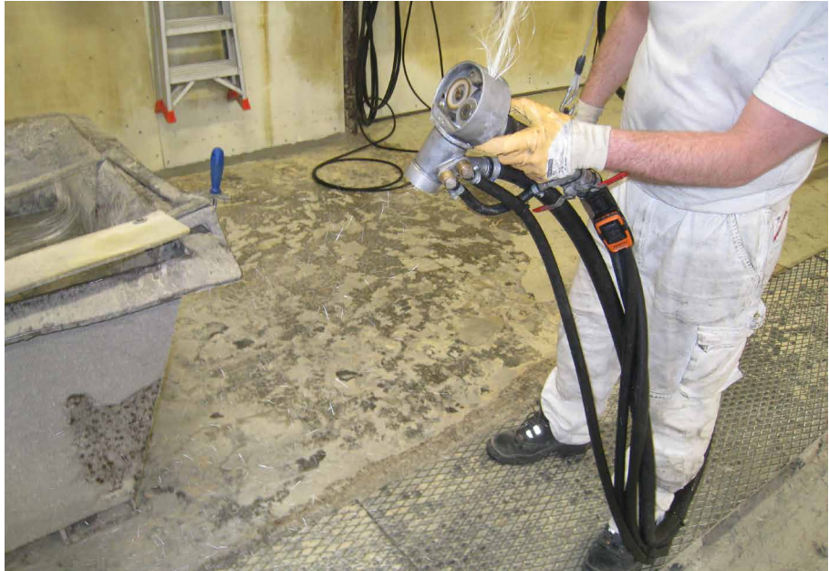
FIGURE 2.4 Typical spraying gun for the hand sprayed method.

Table 2.1 shows the advantages and disadvantages of the sprayed method. The main advantages of this method are the ability to produce a consistent surface finish, with a minimum number of air-bubbles or pores in the surface. However, this method is labour intensive, and requires skilled operators to ensure consistent GFRC quality.