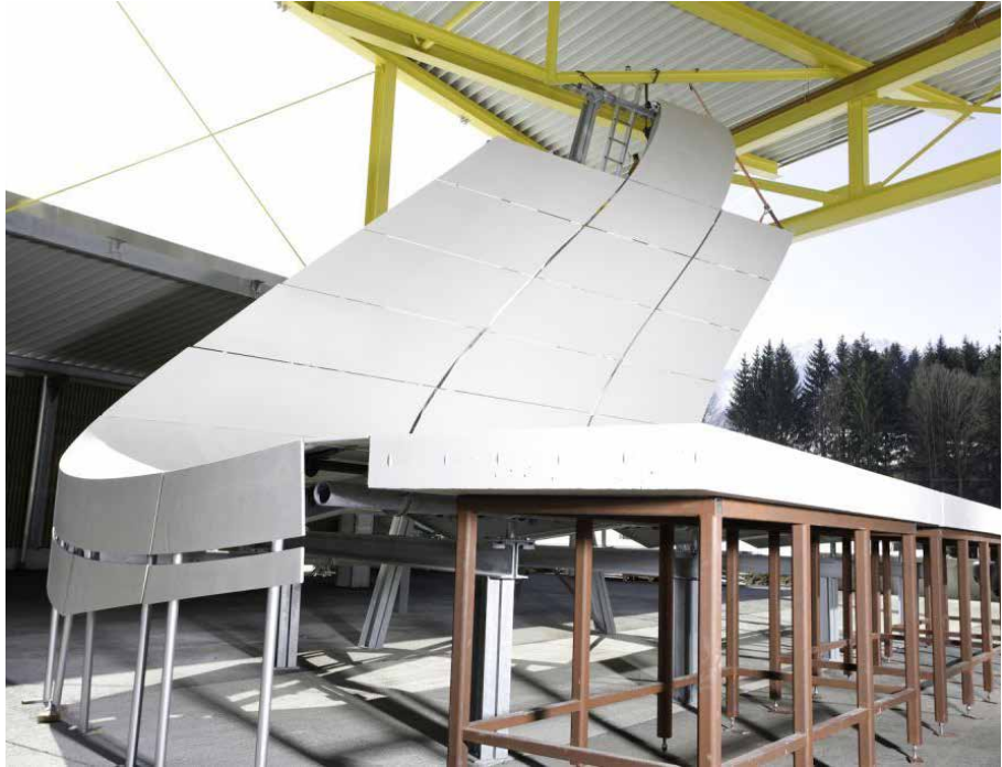
FIGURE 2.5 Single curved GFRP panels without an edge-return, produced with the automated premixed method.

It is possible to use glass fibre mats, (Textile reinforcement) (37), as the primary reinforcement, thus increasing the ultimate tensile capacity of the thin-walled elements and retains post-fracture integrity, (38).