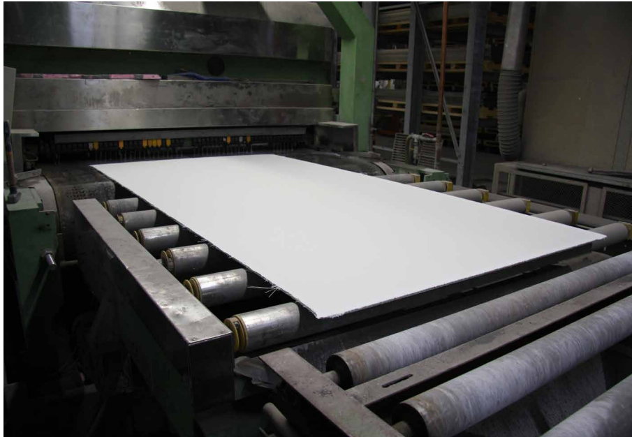
FIGURE 2.3 Automated process for flat thin-walled GFRC.

The limitations of current GFRC manufacture of complex geometry panels are linked to their specific production methods. The sprayed method is dependent on skilled workmanship because the GFRC is applied by hand. Premixed production methods can be automated to advance quality but such methods are currently limited to flat production processes which are vibrated to remove the air-bubbles in the surface. Advancing the material performance overall may be achieved by enhancing the material properties, more controlled curing times, or automation. One method is steam curing, which is used for ultra-high performance concrete (UHPC). The steam curing enhances the tensile capacity up to 34 MPa (13) (14). Figure 2.3 show an automated process for flat thin-walled GFRC.