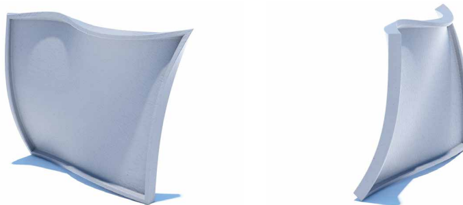
FIGURE 2.1 Renderings of complex geometry thin-walled GFRC.

An example of a complex geometry GFRC panel is shown in Figure 2.1.